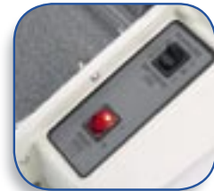
▲ Reverse switch to avoid problems and clear misfeeds