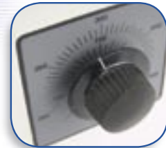
▲ Variable temperature control

Simple control knobs to eliminate wrinkles.