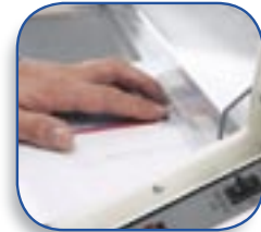
▲ Attached safety shield for added protection